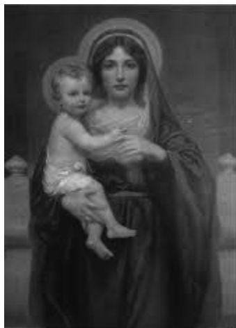
The Virgin Mary in the Kingdom of the Divine Will

Day 23 - "We [The Holy Family] entered the Temple, and first We Adored the Divine Majesty; then we called the Priest , and having placed Him in the Priest's arms, I made the